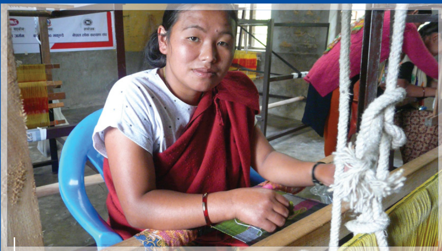
Providing livelihood opportunities for rural women