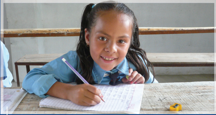
Ensuring quality education for needy children