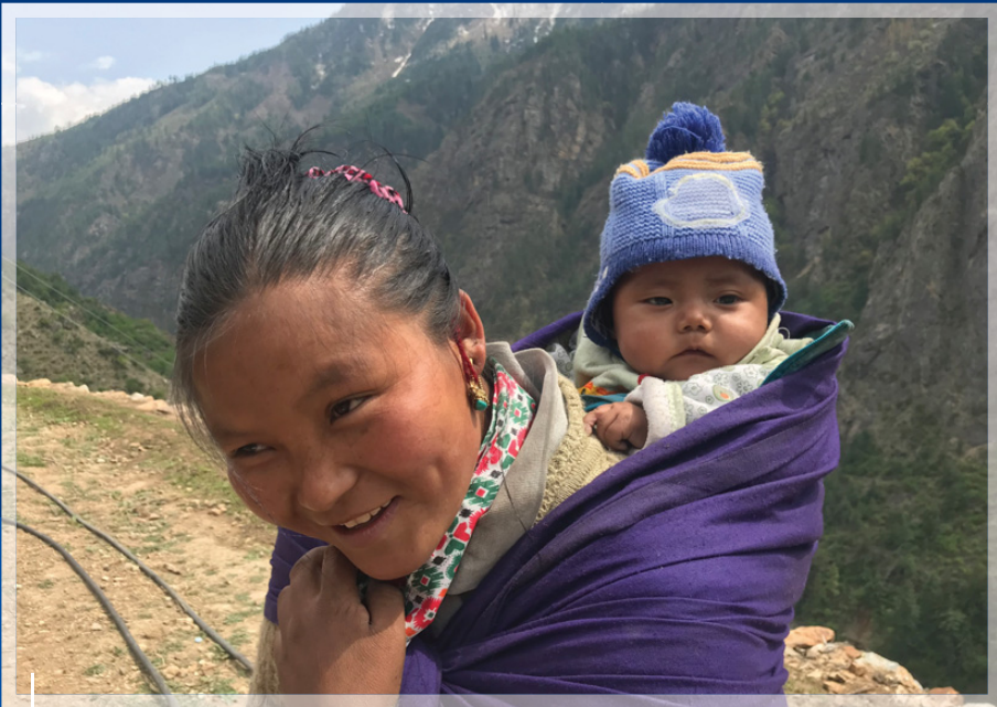
Reducing maternal & neonatal deaths in remote communities