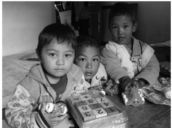
Kids of Setidevi Primary School, Sindhupalchowk provided with ECD kits