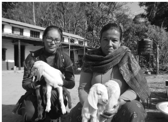
SWAN staff along with a farmer of Kaiya, Narayansthan VDC