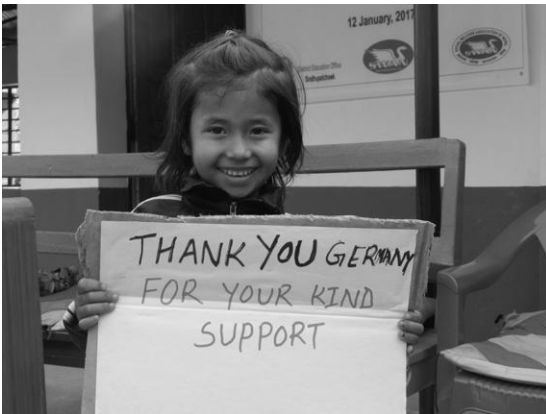
School girl holding a banner to appreciate the efforts of SWAN Deutschland e.V for rebuilding their School damaged by Quake