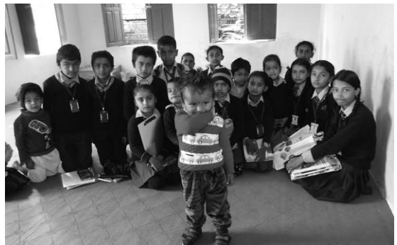
Students of Shree Jana Prakash Primary School, Parbat