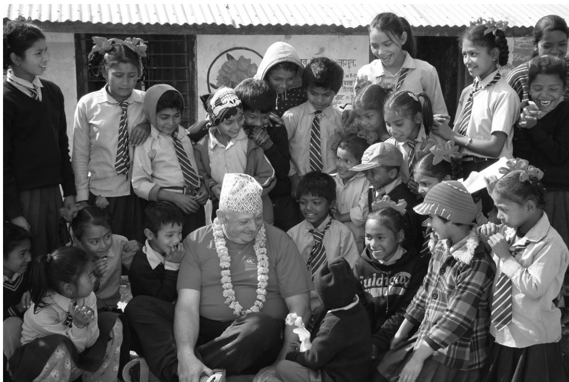
Founder Chairperson of SWAN Österreich visiting the kids of Binamare VDC, Baglung