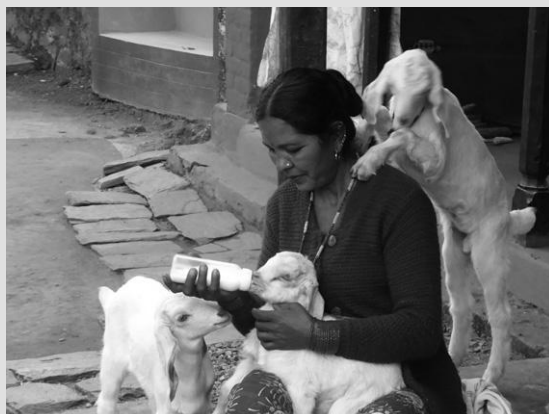
Women raising Goats in Narayansthan VDC, Baglung