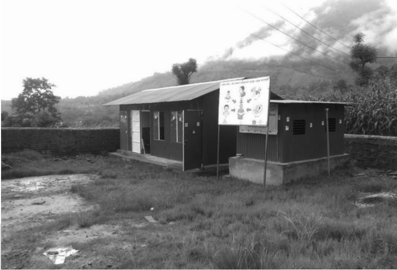
Gunsakot Health Shelter, Sindhupalchowk