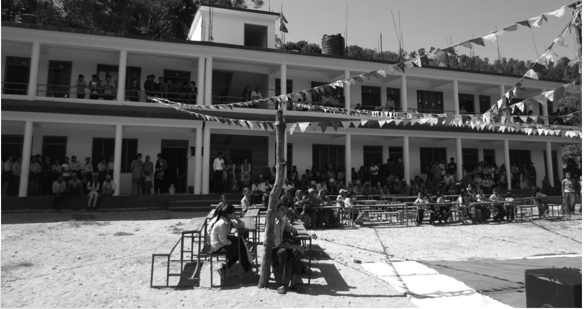
Newly built Shree Jalpadevi Secondary School, Sindhupalchowk