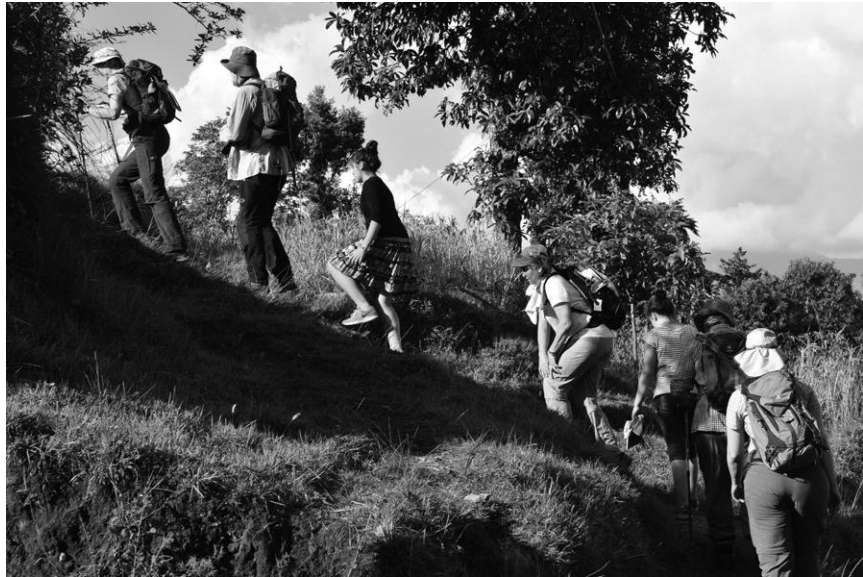
Tourists from Germany en-route to Bhakunde VDC, Baglung

In 2016, 5 groups from Germany and Austria visited the SWAN's Project area in Baglung under the project tour event in the kind support of Eco Trip Nepal Treks and Expedition Pvt. Ltd, travel-to-nature-Asia and FOR FAMILY REISEN of Germany.