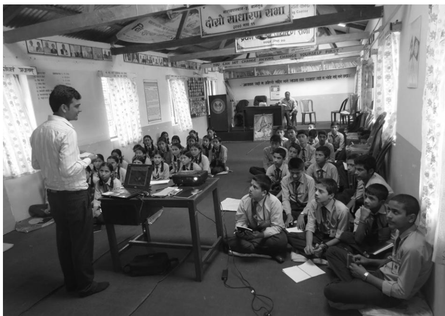
Participants in School Health Education Program

Narayansthan Health Post was facing the shortages of basic medicines because District Health Office (DHO) of Baglung could not supply the medicines to the Health Post due to the shortages in DHO itself as a result of unofficial blockade of India against Nepal. Hence, Narayansthan Health Post was provided with the basic medicines in March, 2016.